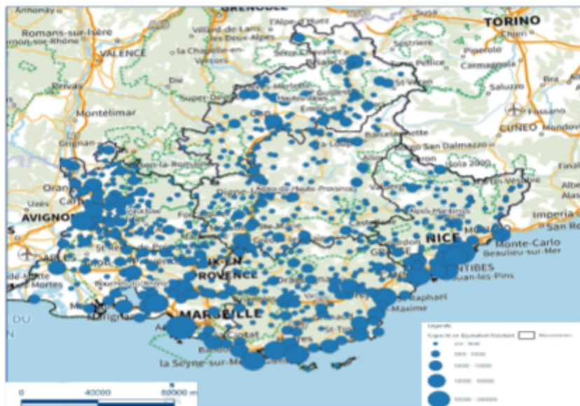
Figure 1 : Location and treatment capacities of WWTPs in the SUD-PACA region

There are 705 active WWTPs in the territory, with a capacity of over 200 eq.inh. Their treatment capacities range from 200 to 1,860,000 eq.inh. The largest WWTP in the region is the Géolide WWTP, located in Marseille. 74% of WWTPs have a treatment capacity of less than 5,000 eq.inh, and 5% have a treatment capacity of more than 50,000 eq.inh. They are mainly located in four areas (Figure 1) : (i) along the Rhone, (ii) along the Durance river, (iii) along the coast and (iv) in the Aix-Marseille metropolis.