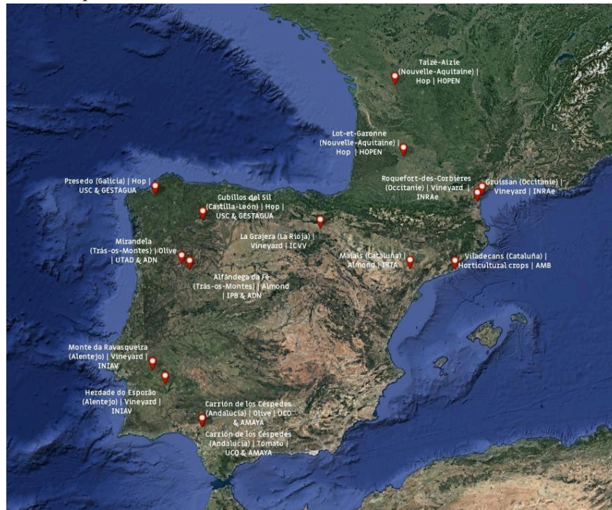
Fig. 1. Location of the pilot actions in the SUDOE area

processes of generating reclaimed water for the I-ReWater pilot actions, allowing the evaluation of the different impacts of its application, and contrast with conventional irrigation systems. Finally, a socio-economic analysis is carried out, based on structured interviews with all the stakeholders involved, in those regions where the use of reclaimed water is consolidated. The aim is to obtain a roadmap to avoid future problems in the new areas in which reclaimed water is incorporated as a new alternative resource.